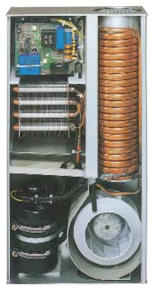
Rotary piston compressors ensure optimal performance.