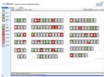
EVENT VIEWER WITH REAL TIME RACK SECURITY.

IP addressable smartlock systems are available for the S2005 range of doors. Providing flexibility, remote locking and traceability. The smartlock system with temperature and humidity sensing, can be fitted to all door configurations.